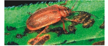
Galerucella species

At the time of insect release, site characteristics including habitat and soil type, size of infestation and water levels are recorded. Follow-up visits to the site occur later in that season, and in subsequent years, so that survival and establishment of the beetles can be assessed and their impact on the plant population evaluated.