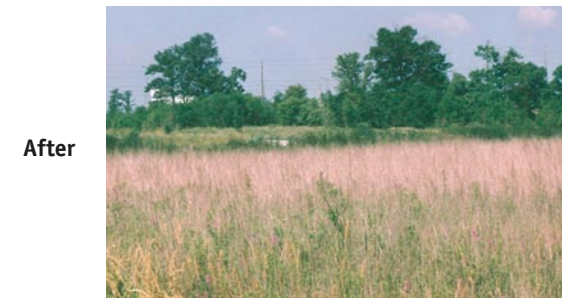
Before & after photos courtesy of Jim Corrigan

In some states and provinces, noxious weed laws or other state/provincial laws make it illegal to plant purple loosestrife ( Lythrum salicaria ) and its cultivars; however, it is still legally available for sale at some locations. DO NOT BUY IT! Also, purple loosestrife seeds are present in some wildflower seed mixes-- check the label before you buy any seed packages.