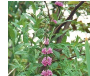
Swamp Loosestrife: Individual flowers ring the stem above leaf pairs. They do not form a flower spike like purple loosestrife.