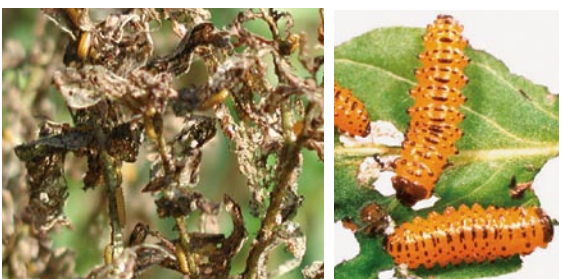
Beetle damage to loosestrife plant Beetle larvae

Obviously, extreme caution must be taken when introducing one organism to control another. Prior to any introduction of a biological control agent, intensive testing is conducted to ensure that a safe and effective agent is selected.