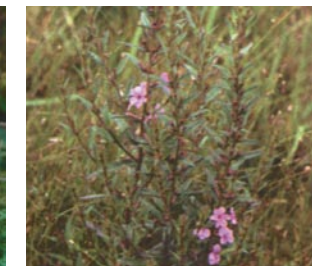
Winged Loosestrife: Leaves alternate with small stems attached to main stem.

Purple loosestrife can easily spread if improper control methods are used. The following chart and guidelines will ensure that your efforts to control the spread of purple loosestrife are effective.