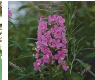
Fireweed: The conical flower spike is 10-13 cm (4-5 inches) wide at the base. Stem is round and leaves alternate.