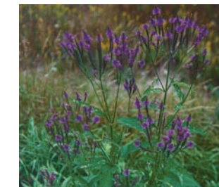
Blue Vervain: Small purple flowers ring the stem; edges of leaves are toothed.